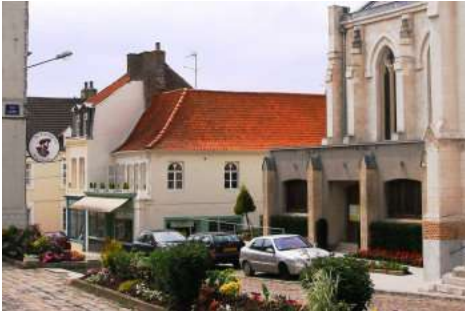
Boursot's Wine Collection in Ardres